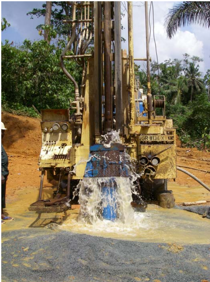
Figure 2: Unexpected high groundwater flows from Basement rocks in Africa

In a recent study in Africa a proposed mine was based on a water supply from surface water. At the level of full feasibility study it was strongly recommended to look at the potential pit inflows from adjacent alluvial sediments in the river valley. The profile was the typical African sequence of saprolite underlain by partially weathered and fractured bedrock, overlying low permeability rock, in which the partially weathered horizon of a few metres thickness is usually water bearing to some degree and provides much of the groundwater for village wells. Five boreholes were drilled for a combination of piezometer installation and test pumping. It was identified that the main aquifer was the underlying fractured bedrock so far drilled and tested to depths of around 100m and all holes with consistently very high yields (Figure 1). Earlier investigation or data collection at exploration stage would have identified potential problems for pit drainage but also identify a plentiful water supply.