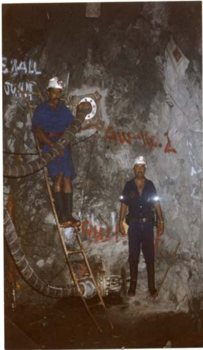
Figure 3: Underground hydraulic testing.