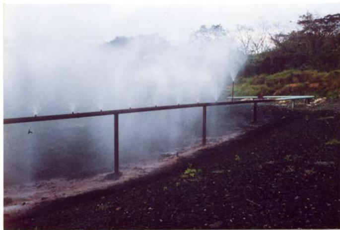
Figure 4: heat dissipation from hot groundwater